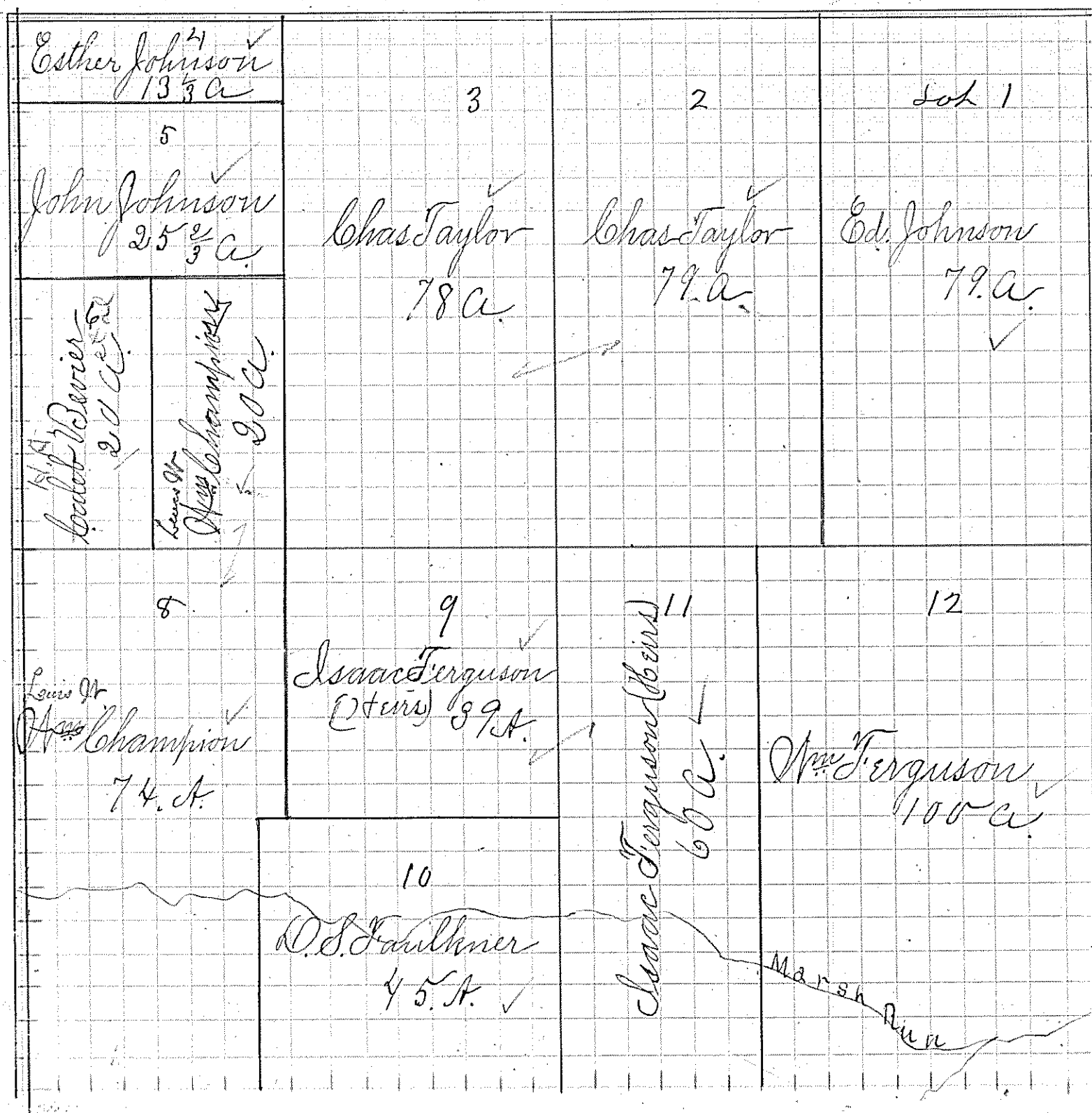
Section No. 26 Twp. 22 N. R. 20 W.