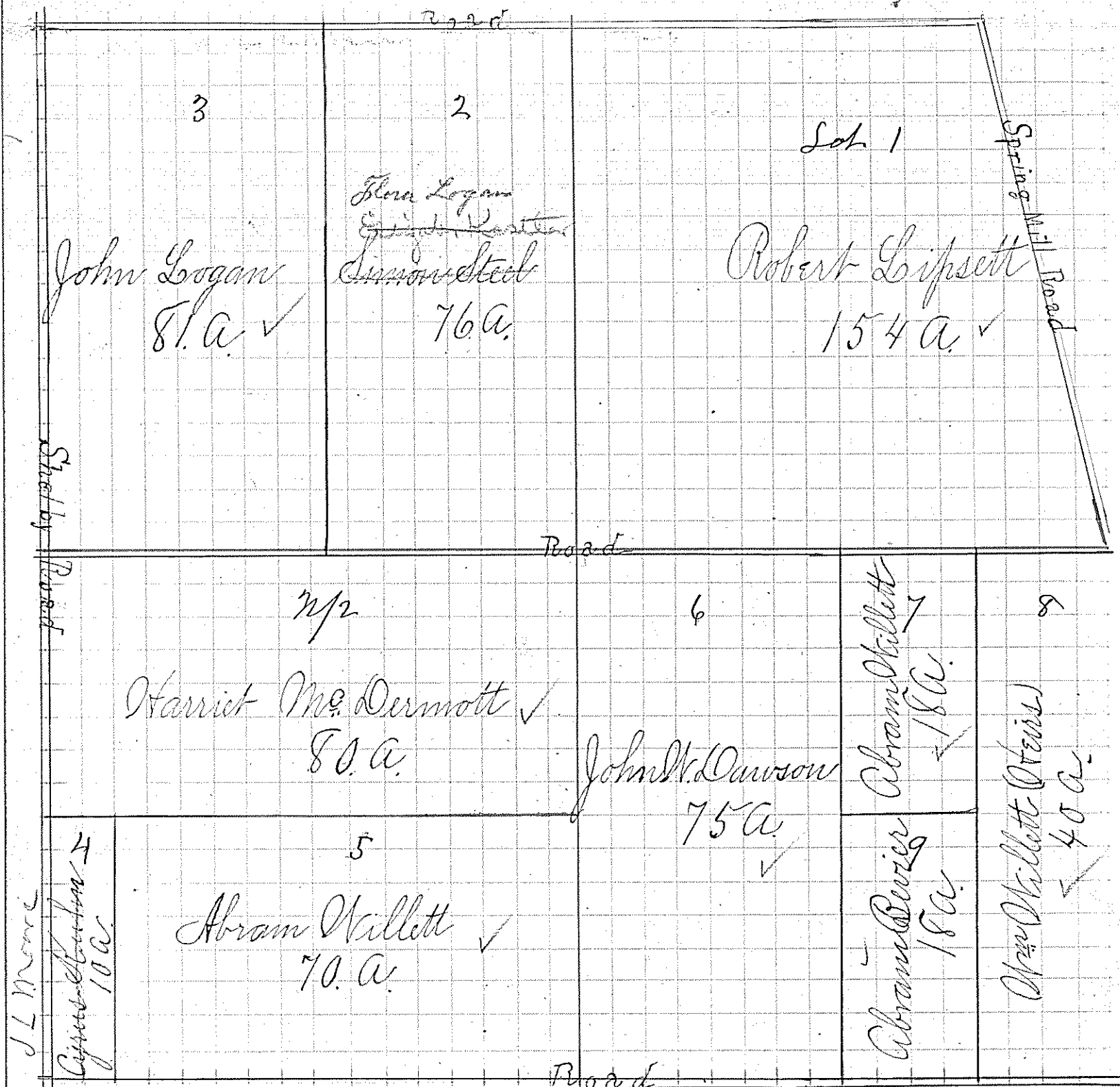
Section No. 18. Tp. 23. R. 19.