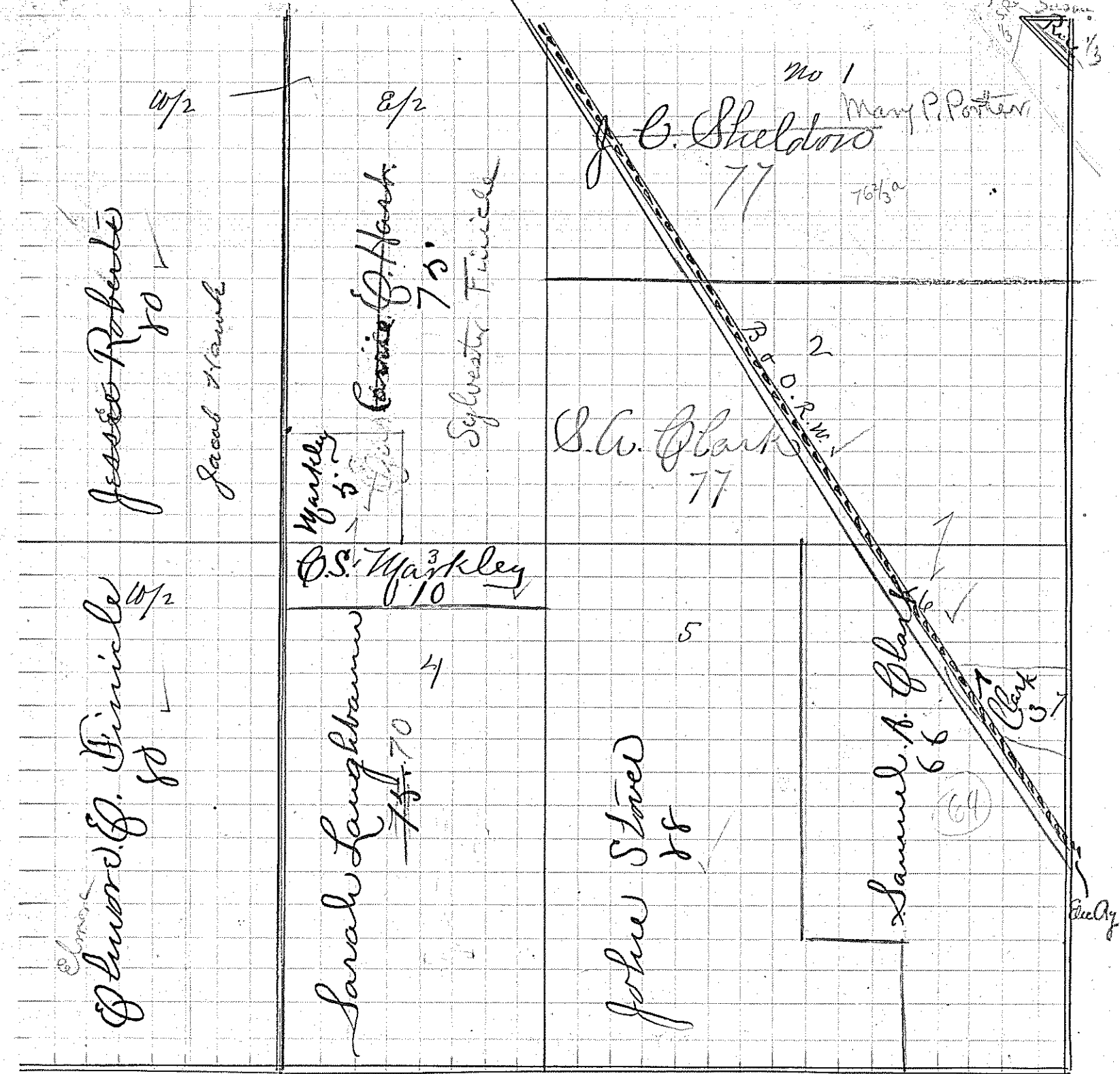
Section No. 22.