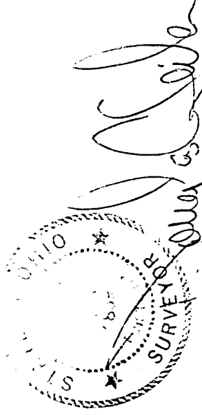
Douglas C. Seiler Professional Surveyor #6869

Bearings are based on Survey I-132 on file at the Richland County Tax Map Department and are intended to be used for angular determination only.