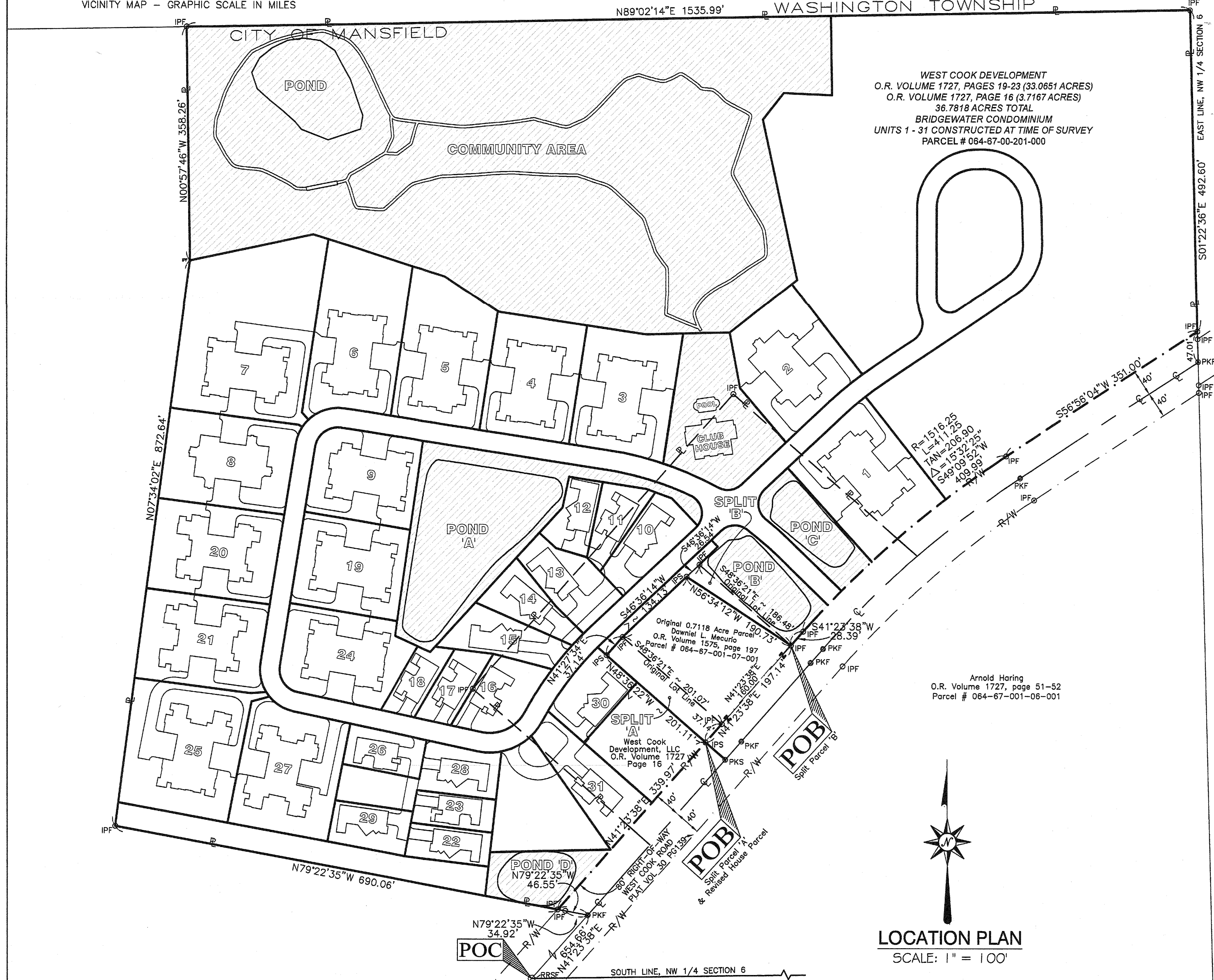
LOCATION PLAN SCALE: 1" = 100'

DEAN R. FREDERICK OHIO PROFESSIONAL SURVEYOR #6131 DATE: 6/24/15